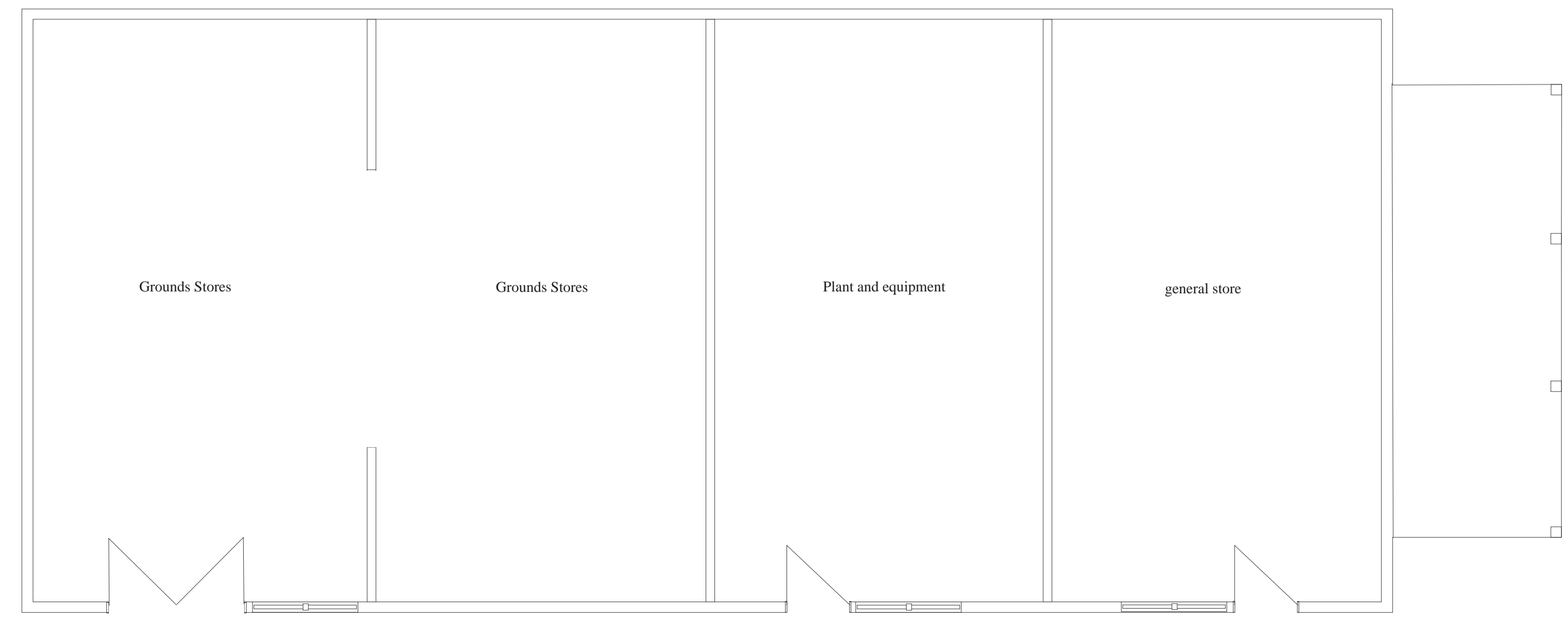
PLAN VIEW BASEMENT AREA